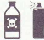
household hazardous waste